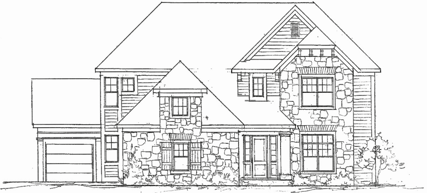
FRONT ELEVATION - KENNEDY