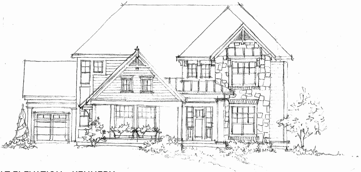
ALT ELEVATION - KENNEDY

THE FLOOR PLAN OR OPTIONAL BASEMENT BROCHURE SHOWN ABOVE IS A CONCEPTUAL FLOOR PLAN. THE ELEVATION RENDERING IS ALSO A CONCEPTUAL VIEW OF THE HOME. PRICES, PLANS, DIMENSIONS AND SPECIFICATIONS ARE SUBJECT TO CHANGE WITHOUT NOTICE.