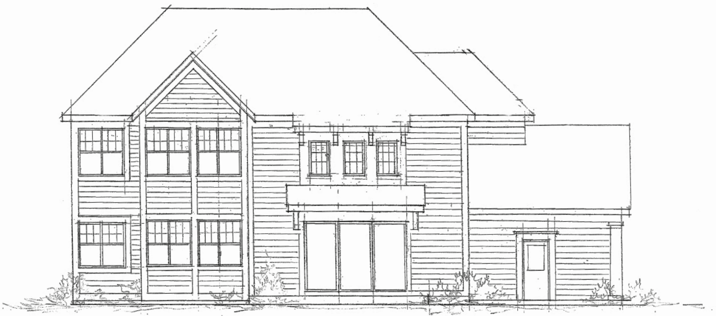
REAR ELEVATION - KENNEDY

THE FLOOR PLAN OR OPTIONAL BASEMENT BROCHURE SHOWN ABOVE IS A CONCEPTUAL FLOOR PLAN. THE ELEVATION RENDERING IS ALSO A CONCEPTUAL VIEW OF THE HOME. PRICES, PLANS, DIMENSIONS AND SPECIFICATIONS ARE SUBJECT TO CHANGE WITHOUT NOTICE.