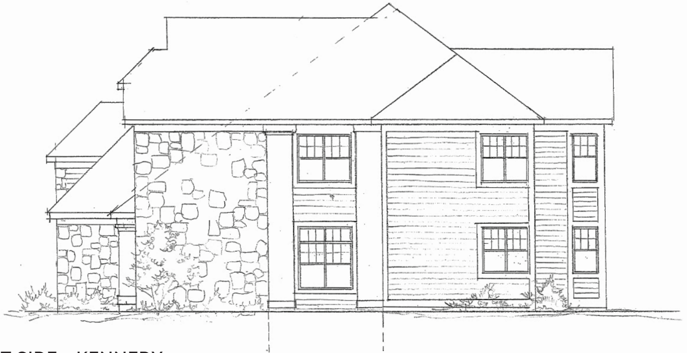
RIGHT SIDE - KENNEDY