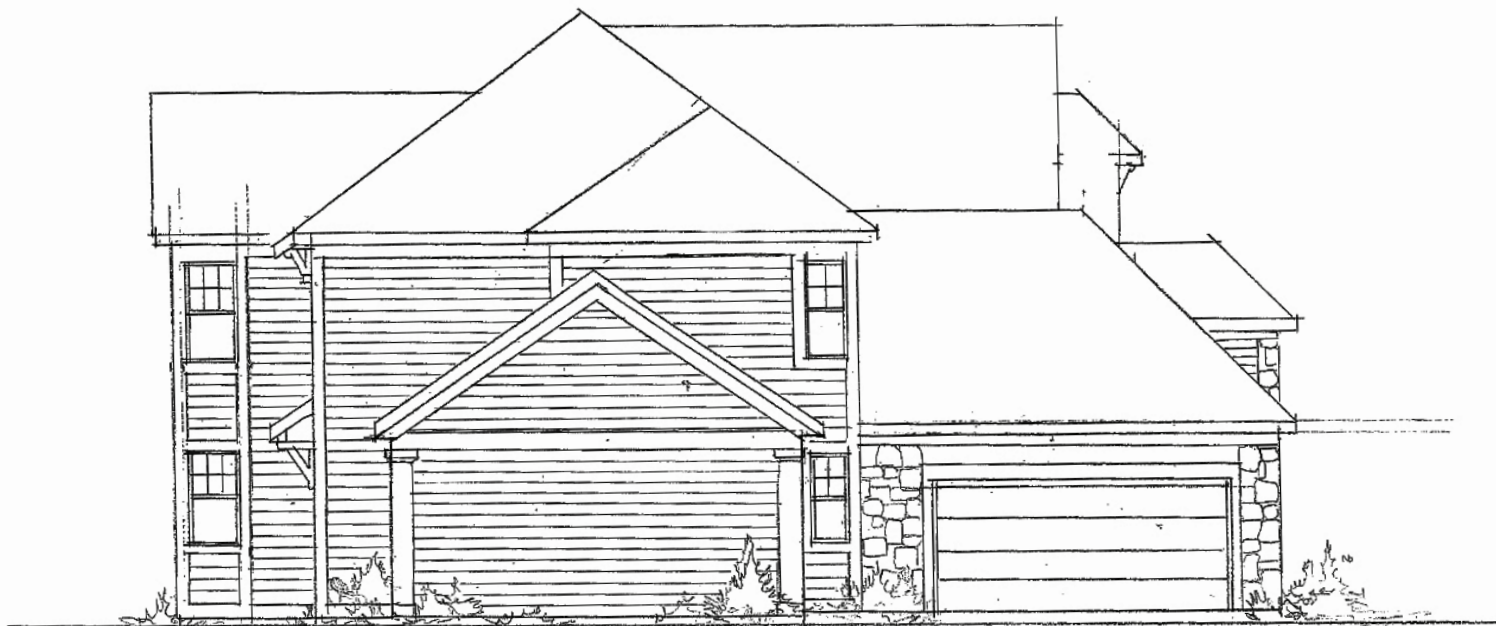
LEFT SIDE - KENNEDY

THE FLOOR PLAN OR OPTIONAL BASEMENT BROCHURE SHOWN ABOVE IS A CONCEPTUAL FLOOR PLAN. THE ELEVATION RENDERING IS ALSO A CONCEPTUAL VIEW OF THE HOME. PRICES, PLANS, DIMENSIONS AND SPECIFICATIONS ARE SUBJECT TO CHANGE WITHOUT NOTICE.